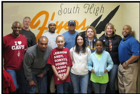
Frito-Lay employees and South High School students stand in front of a mural completed on MLK Jr. Day.

More than 120 CMSD students honored the spirit of Dr. Martin Luther King, Jr. and celebrated a renewed interest in service by choosing to make January 19, 2009 a day ON. While most of their peers were enjoying a day off school to celebrate MLK, Jr. Day, 120 CMSD middle and